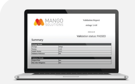
The assessment of the R package follows a fullyaudited, quality controlled process to determine whether a package is able to be validated

This may lead to a reluctance of trust in use of R as Data Practitioners are unable to satisfy their IT and Compliance teams; causing unnecessary time and resources being dedicated to monitoring or approving R packages.