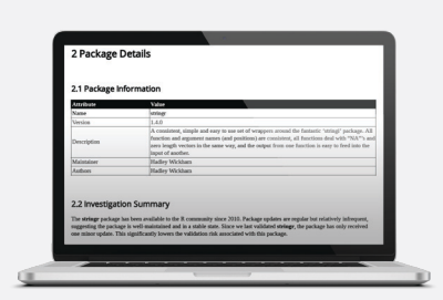
The stringent validation process followed for each package is fully documented and provides assurance that the ValidR delivery is both robust and stable